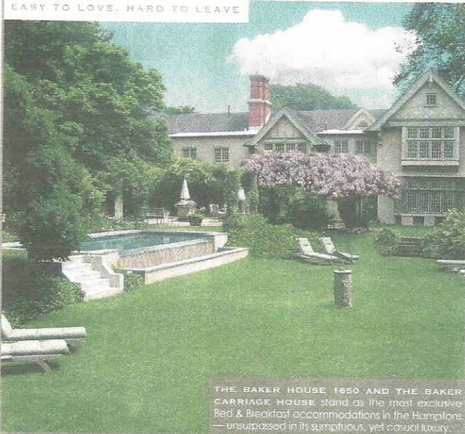
THE BAKER HOUSE, 1650 AND THE BAKER CARRIAGE HOUSE stand as the most exclusive Bed & Breakfast accommodations in the Hamptons — unsurpassed in its sumptuous, yet casual luxury.